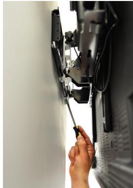
INCLUDES SCREWS TO SECURE DISPLAY FOR THEFT DETERRENCE